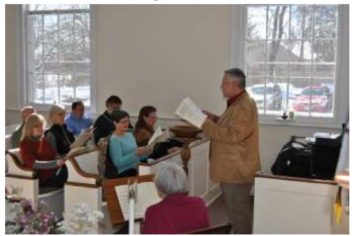
The choir rehearses most Sundays following morning worship

The music department and Choir wish everyone a wonderful Easter and spring season.