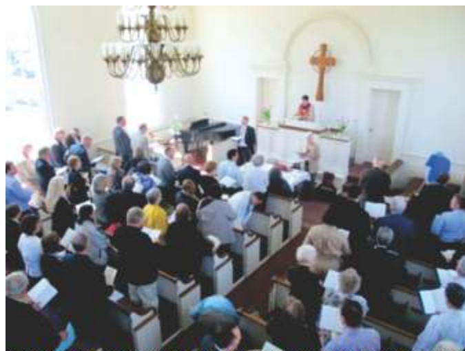
Members of the Presbytery of Long Island meet at Old South Haven Church, April 16, 2013