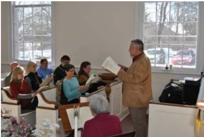
The choir rehearses most Sundays following morning worship

The music department and Choir wish everyone a wonderful Easter and spring season.