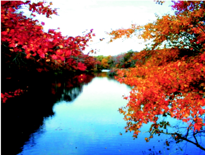
Beaver Dam Creek, Brookhaven

I sat down to write this article having just returned from my daily (almost) three mile walk. I had missed two days because of being gone. Three days ago I marveled at the beauty of trees aglow in color: red, yellow, orange. I marveled in God's creation: God the Artist. Today as I