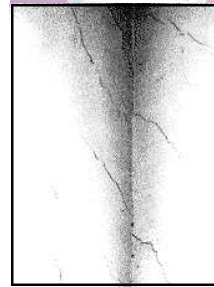
Plasterer repaired cracks and applied special finish to minimize future cracking and crazing.