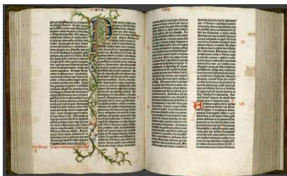
Gutenberg Bible, first major book printed with moveable type

Before the month of September is over Borders will close its stores. I am going to miss my weekly trips to the one just off Sunrise Highway at Johnson Avenue. My records show I would buy around thirty books each year from this outlet plus buying books from other sources. I love buying books and, in most cases, actually getting around to reading them as well. I have been a book lover from an early age.